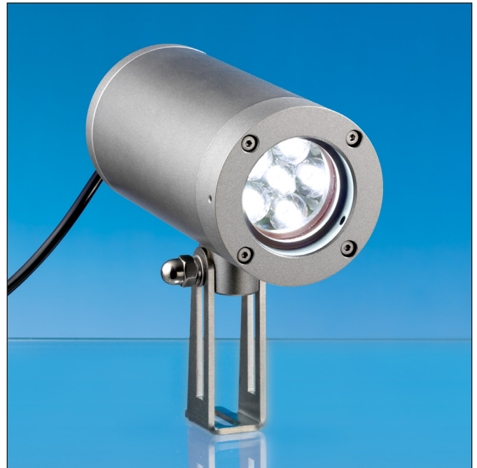
Lumistar luminaire ASL 55-LED-Ex

24 V AC/DC LED 11 W/15 W 120-230 V AC/DC LED 11 W/15 W Protected by 1A miniature fuse. Equipped with 4 or 7 high-power LEDs.