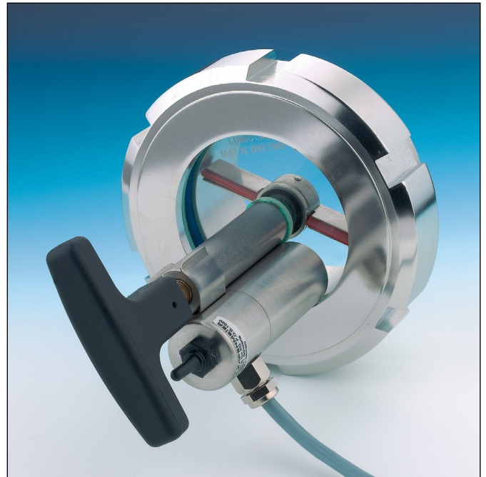
Mini Lumistar luminaire USL 01, mounted on a screw-type sight glass fitting with Lumiglas sight glass wiper SW I