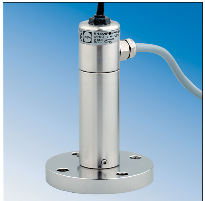
Mini Lumistar luminaire USL 31 for BioControl applications