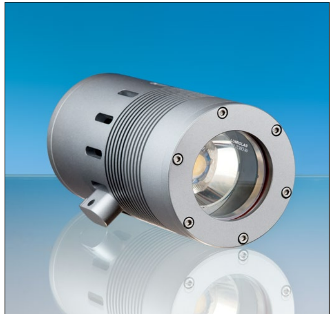
Lumistar luminaire ASL 57-LED

Luminaires for sight glasses on circular fittings and visual flow indicators are mounted on the mating flange using the hinged bracket. With the screw-type sight glass fitting similar to DIN 11851, the luminaire is fastened with a flange collar or direct on the slotted nut.