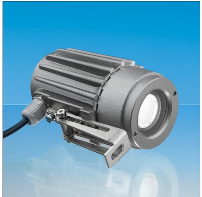
Lumistar luminaire USL 05-LED