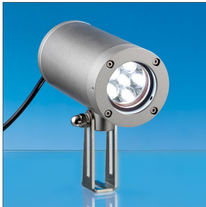
Lumistar luminaire ASL55LED-Ex