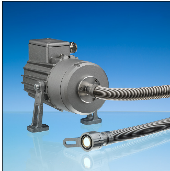
Lumistar luminaire Lumiflex USL 07 ALF-Ex

• Convenient electrical connection via integrated terminal box; cable entry gland M20 x 1.5