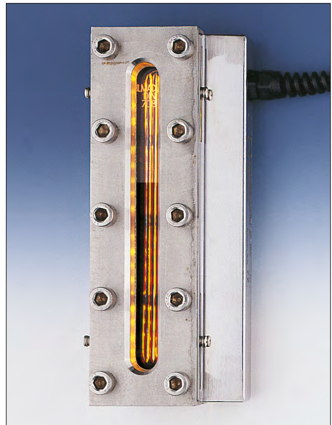
Front view of rectangular sight glass unit, length 250 mm, with side-mounted Lumistar luminaire REL 01 in stainless steel