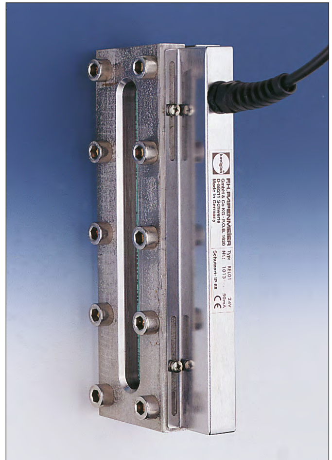
Lumistar luminaire REL 01, attached to the cover flange of a rectangular sight glass unit, side view