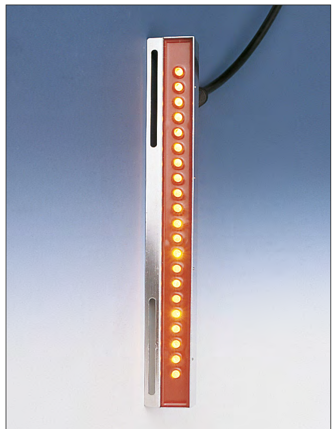
Lumistar luminaire REL 01, luminary side

The luminaire is optimally designed for use with a 250 mm long rectangular sight glass unit. Additional Lumistar luminaires REL 01 can be installed if the fittings are longer.